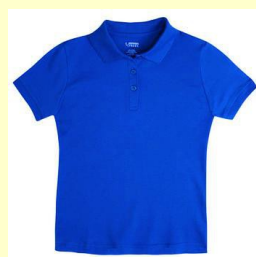
Knit Polo Shirts Burgundy and Royal Blue with School Logo MUST BE ORDERED THROUGH SCHOOL Please order by July 1 st