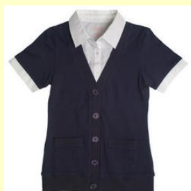
Cardigan Blouse Twofer (ages 12 & up)