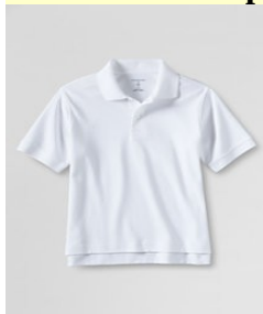
White Polo Shirt (for wear with jumpers)